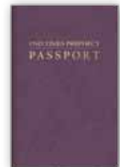
End Times Prophecy Passport by Insight for Living softcover book

To order any of these related resources, call 0800-787-9364 or visit www.insightforliving.org.uk