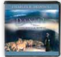
Daniel, Volume 1: God's Man for the Moment by Charles R. Swindoll compact disc series