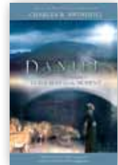
Daniel, Volume 1: God's Man for the Moment Bible Companion by Insight for Living softcover book