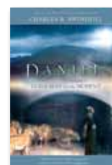
Daniel, Volume 1: God's Man for the Moment Bible Companion

by Charles R. Swindoll compact disc series