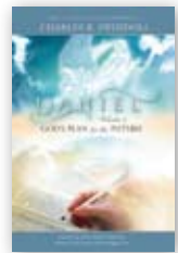
Daniel, Volume 2: God's Plan for the Future Bible Companion softcover book