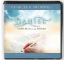
Daniel, Volume 2: God's Plan for the Future by Charles R. Swindoll compact disc series