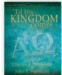
'Til His Kingdom Comes: Living in the Last Days by Charles R. Swindoll and John F. Walvoord softcover book

To order any of these related resources, call 0800-915-9364 or visit www.insightforliving.org.uk