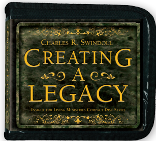
Creating a Legacy by Charles R. Swindoll CD series