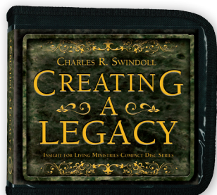
Creating a Legacy by Charles R. Swindoll CD series