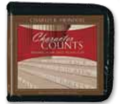
Character Counts: Building a Life That Pleases God by Charles R. Swindoll CD series