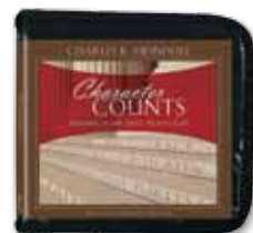
Character Counts: Building a Life That Pleases God by Charles R. Swindoll CD series