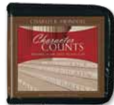
Character Counts: Building a Life That Pleasures God by Charles R. Swindoll CD series