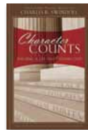
Character Counts: Building a Life That Pleasures God Bible Companion softcover book