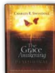
The Grace Awakening Devotional A Thirty-Day Walk in the Freedom of Grace by Charles R. Swindoll hardcover book