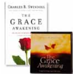
The Grace Awakening Set by Charles R. Swindoll 14 CD and paperback book set

To order any of these related resources, call 0800 787 9364 or visit www.insightforliving.org.uk