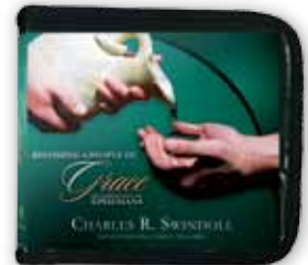
Becoming a People of Grace: An Exposition of Ephesians by Charles R. Swindoll CD series of 26 CDs