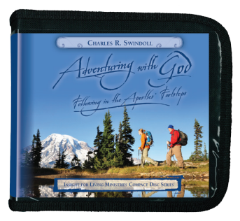
Adventuring with God by Charles R. Swindoll CD series