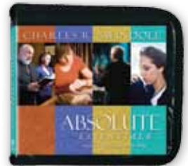
Absolute Essentials by Charles R. Swindoll CD series