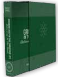
Growing Deep in the Christian Life by Charles R. Swindoll CD series