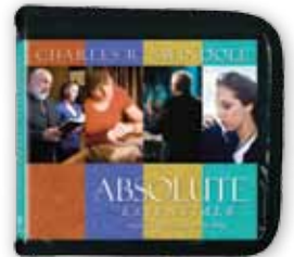
Absolute Essentials by Charles R. Swindoll CD series