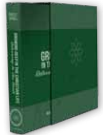
Growing Deep in the Christian Life by Charles R. Swindoll CD series